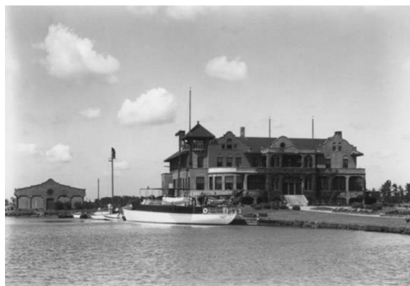
Powerboating Magazine -June 1925