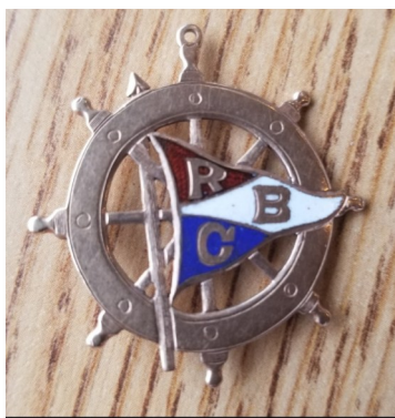
RBC burgee pin

In 1896 this greenspace was renamed "Walbridge Park" in honor of John Walbridge, the man who had donated the land to the city for public use (his son was also the sitting chairperson of the City Parks Commission). The title "Riverside Park" was transferred to the lower Summit Street property the same year and a public boathouse was erected on stilts with a causeway connecting it with the land. The park occupied a high flat bluff between Galena Street and Ohio Street. The public boathouse's anchorage area was utilized by the fleet of the Toledo Yachting Association until 1903 when they moved into new accommodations just downriver at another city park, Bay View Park, which had been established with the same land purchase in 1893. Likewise, the same anchorage was the original home of the Toledo Power Boat Club from its founding in 1905 until 1907. Within a few years the park had fallen into disrepair due to general neglect by the city. Riverside Boat Club was founded in 1912 as a neighborhood boat club made up of small boat owners who lived in the vicinity of Riverside Park. The group struck a deal with the city that they would overtake the care and upkeep of the park in exchange for use of the boathouse as their official meeting place and launch.